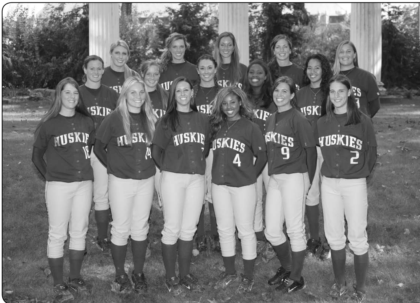
The 2006 Huskies won the Provo Regional to advance to their second consecutive Super Regional.